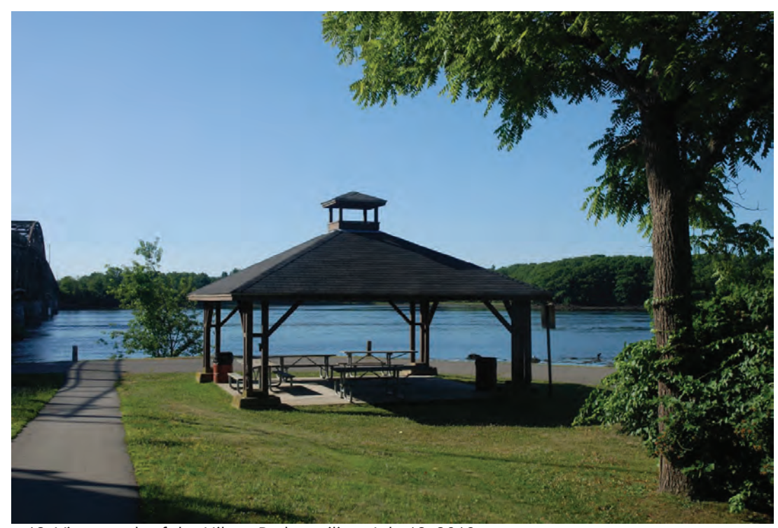
12. View south of the Hilton Park pavilion. July 12, 2019.