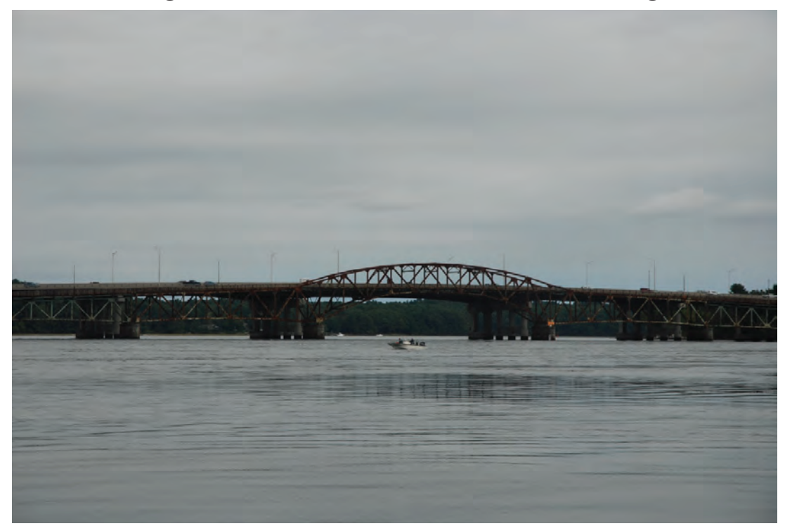
7. View east of the GSB from a boater's perspective. September 13, 2018.