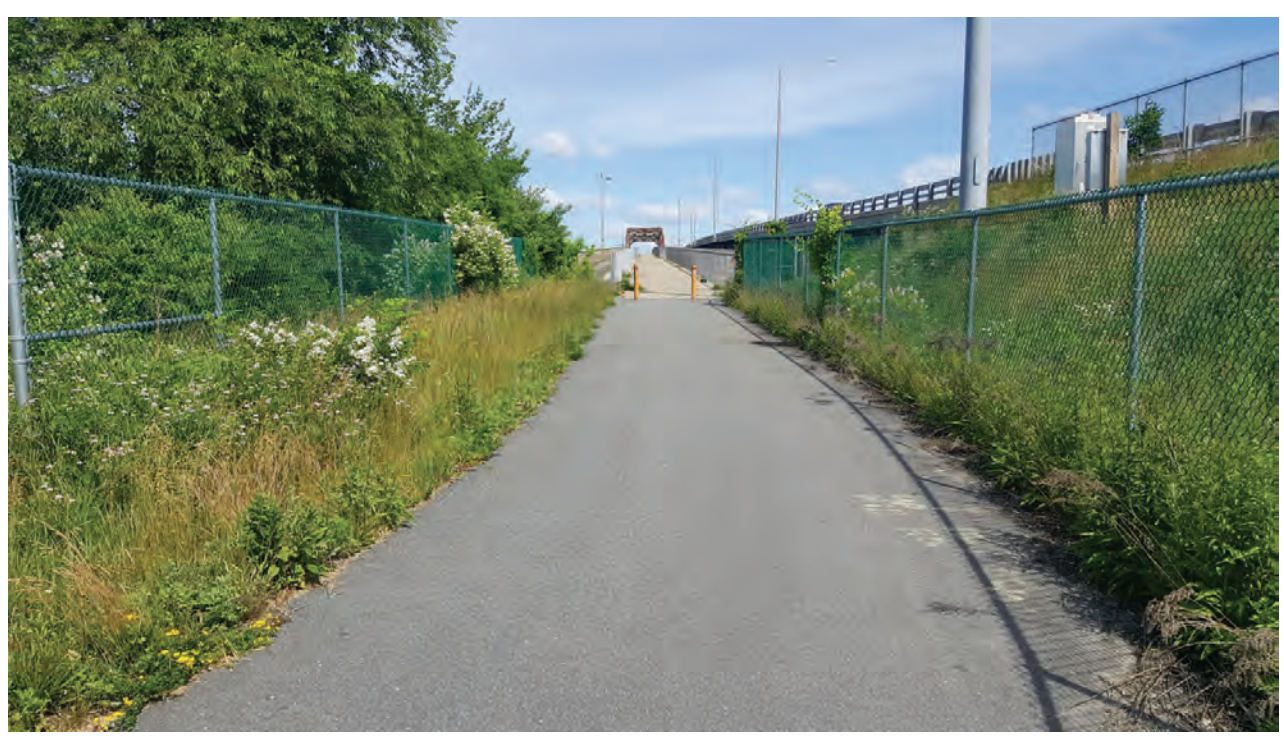
2. Newington side – pedestrian view north toward the GSB from the approach. June 19, 2018.