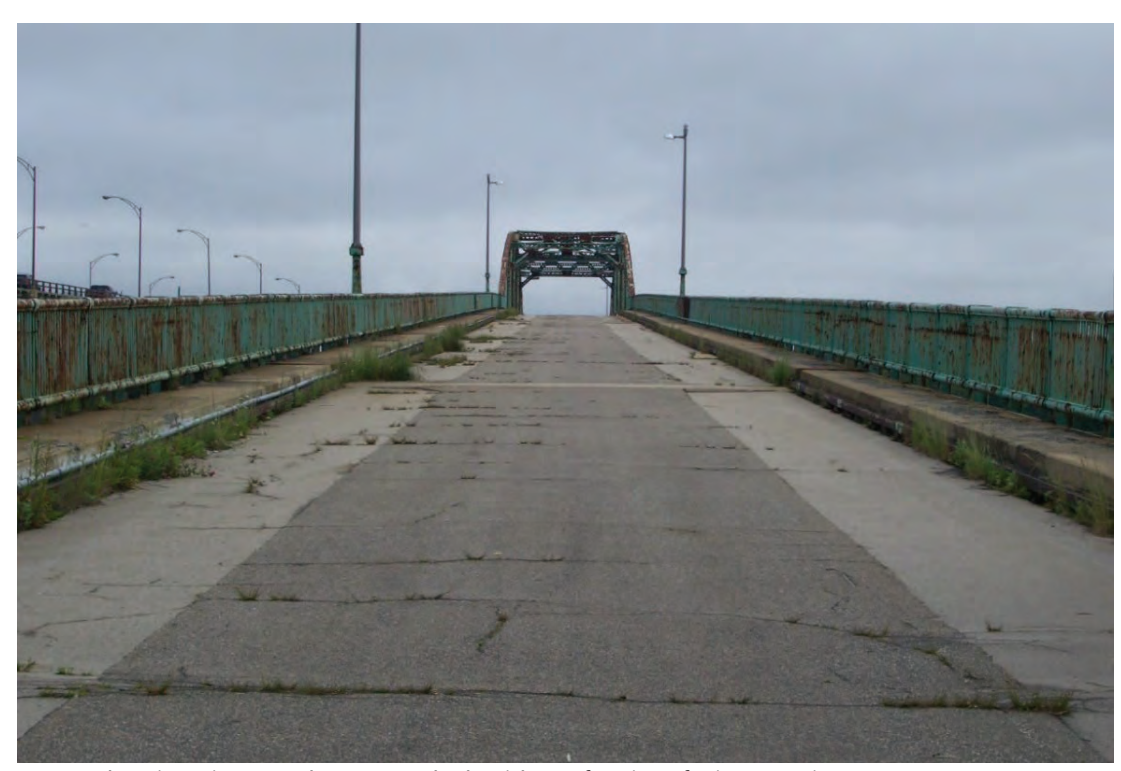
4. Pedestrian view south on GSB deck without fencing, facing Newington. June 24, 2009.