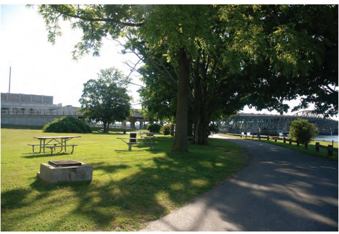
10. View east from Hilton Park's tree-lined access road of the GSB. July 12, 2018.