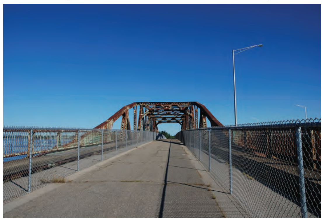
5. Pedestrian view north on the GSB deck toward Dover. July 12, 2018.