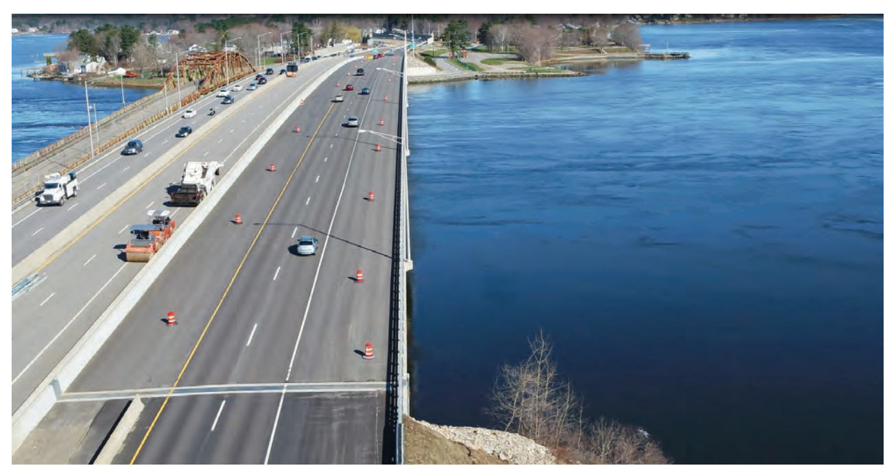
1. Aerial of the GSB and LBB decks over Little Bay, view north (toward Dover). April 17, 2019.