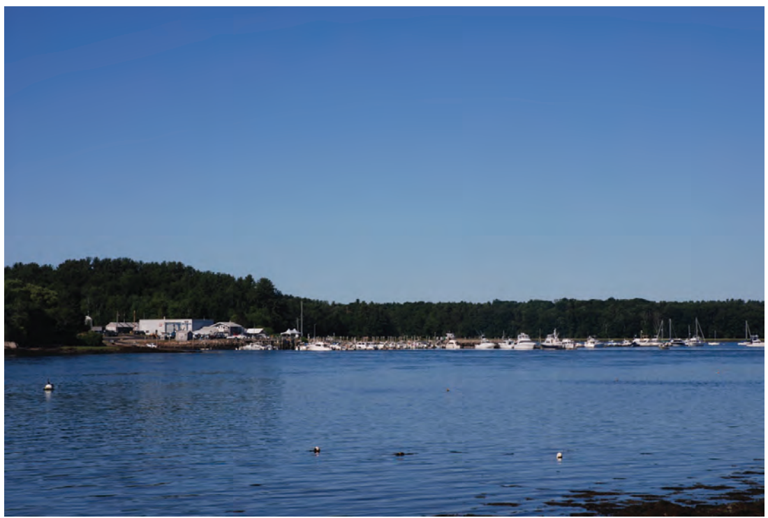
9. Looking southwest from Hilton Park towards the Great Bay Marine, Inc. in Newington. July 12, 2018.