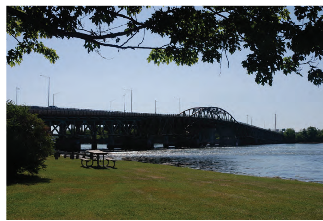
8. Looking to south toward GSB from west side of Hilton Park. July 12, 2018.