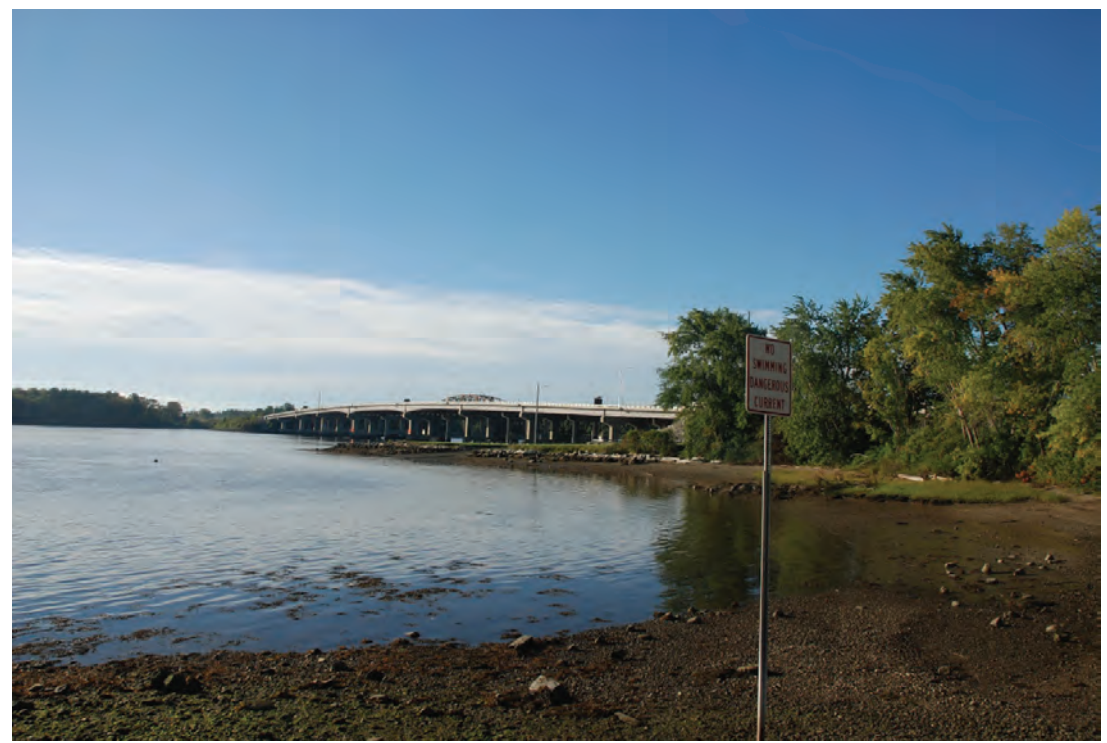
11. View south from the east side of Hilton Park. September 13, 2018.