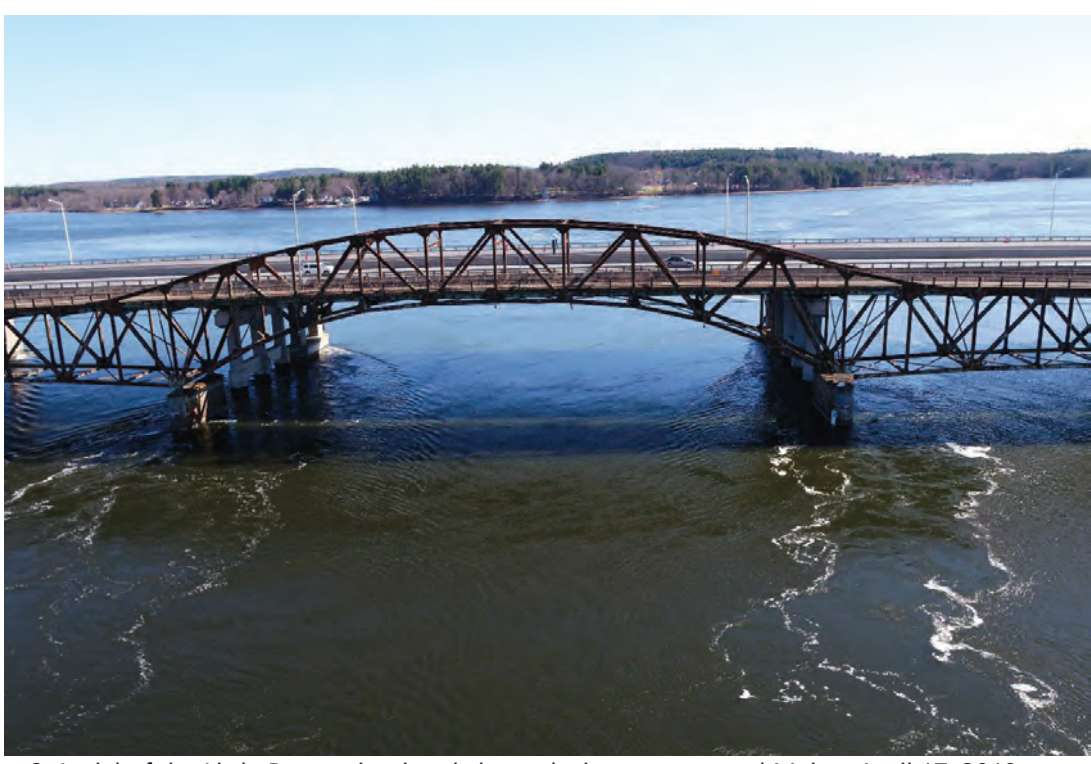
6. Aerial of the Little Bay navigational channel, view east toward Maine. April 17, 2019.